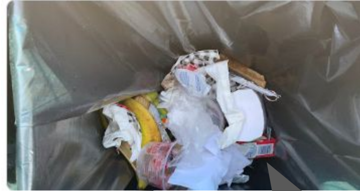
Recyclable Plastic Pot!