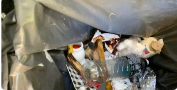
Recyclable Plastic Bottle!